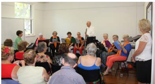
All About Living Choir "All Directions" performing