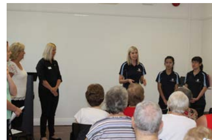
Students from QUT